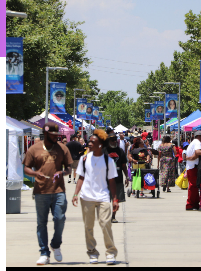
GOAL 2: BE A DIVERSE, EQUITABLE, INCLUSIVE, & ANTI-RACIST INSTITUTION

Though celebrated by many Black communities throughout the United States for over a century, Juneteenth only became a federal holiday in 2021.