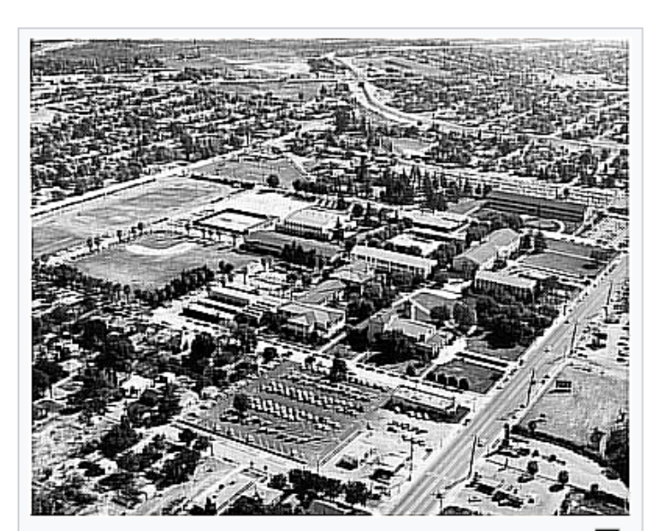
Colegio Junior de San Bernardino, alrededor de 1933

GOAL 2: BE A DIVERSE, EQUITABLE, INCLUSIVE, & ANTI-RACIST INSTITUTION.